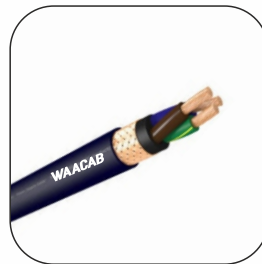
LT Power & Control Cables