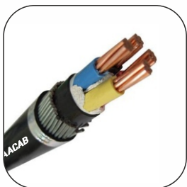
Heavy Duty Industrial Cables