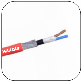
Fire Survival Cables